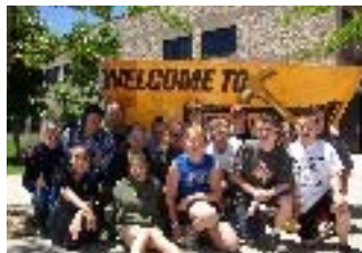
Mentor Baptist Church Elkins, West Virginia - June 2004

Summer mission trips are a great way to get young people involved in ministry and more aware of the world around them. Several district churches participate in such trips and some would be glad to include students from smaller churches if they can arrange it. Please contact the MBC office right away and we'll put you in contact with those churches that have space available for trips this summer.